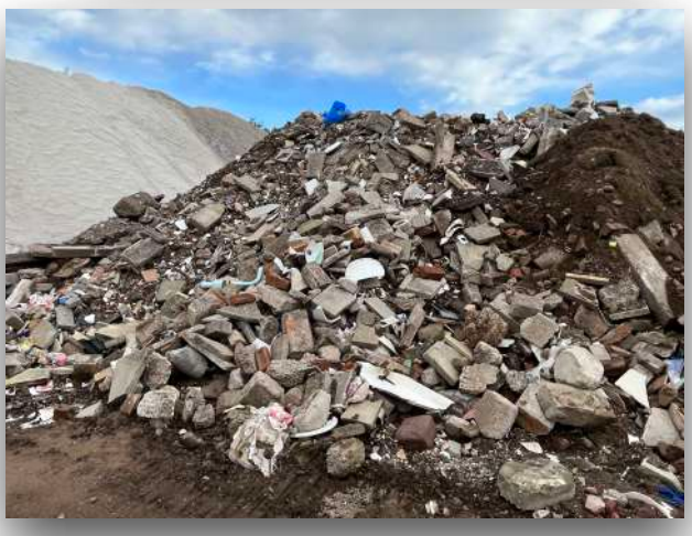
This was the source of the demolition waste