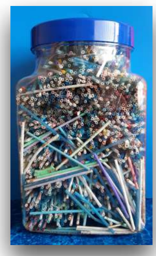
Cotton buds picked up on Monifieth beach.

If laid out they would stretch for more than 171 metres.